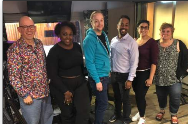
Workshop Casting, Workshop, Studio Recording