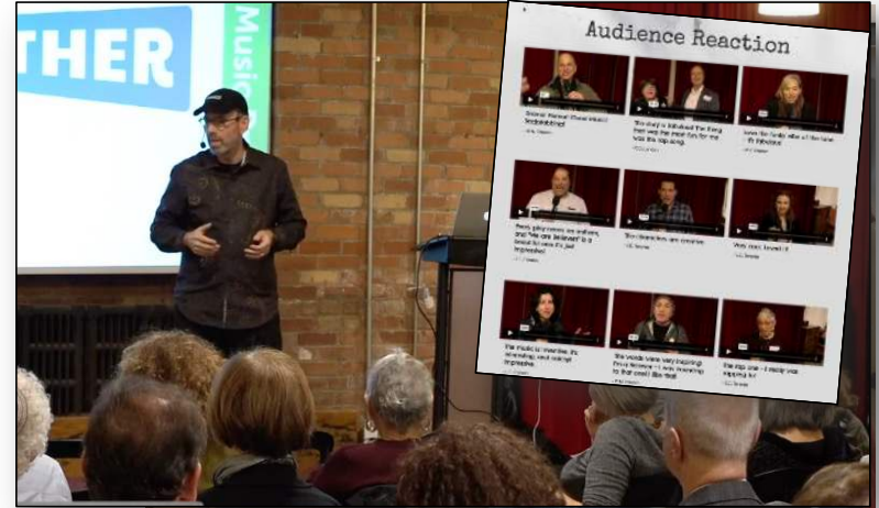
Musical Preview Event Introducing 200 people to the "v2" music