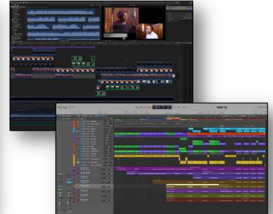
Production of Studio Video of Who Is Esther