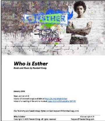
Final Manuscript (Input from 43+ people)