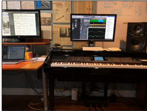
Music: 21 songs (v1)